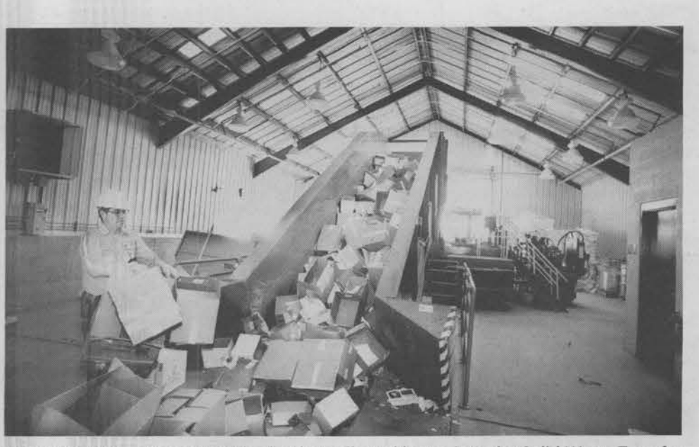
OVER THE TOP — Josue Gonzalez loads cardboard boxes into the Solid Waste Transfer Facility's state-of-the-art conveyor/compactor system. A neat, densely packed one-ton bundle of recyclable material comes out at the other end.

The primary function of the transfer facility is to screen incoming waste for hazardous or prohibited materials before it is sent off-site for disposal, Gabe says. The secondary function is to act as the Labs' recycling center. In addition to handling waste and recyclable material from Sandia, the Trash Majal also accepts recyclable materials from Los Alamos National Labs and local DOE offices. (Continued on page 12)